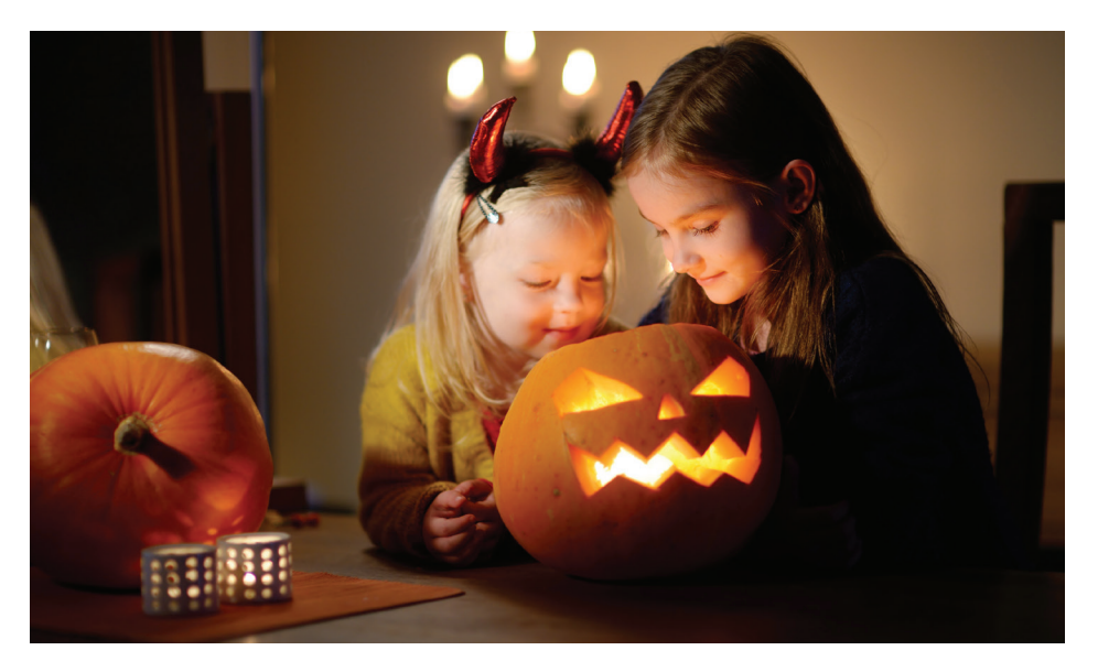
Tips to Educate Your Family During Fire Prevention Week